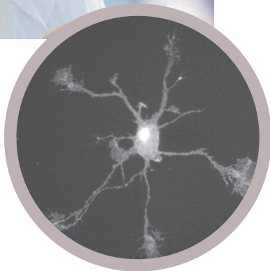
Sample Image from the IR1000

Well suited for the following applications: